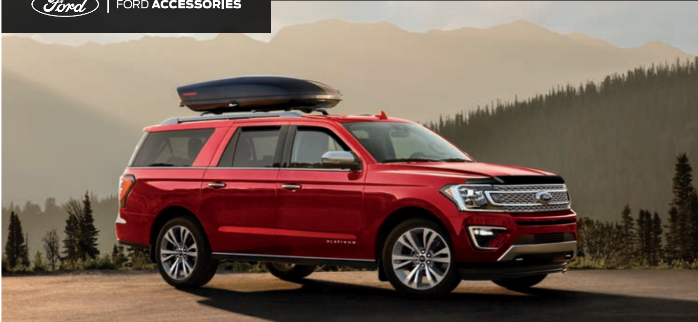
Platinum MAX in Rapid Red Metallic Tinted Clearcoat 1 accessorized with hood deflector, side window deflectors, 2 front and rear molded splash guards, roof crossbars 3 and roof-mounted cargo basket 2,3