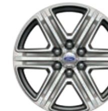
XLT 20" Luster Nickel-Painted Aluminum Optional (requires 201A or 202A) n/a with Black Accent Package or FX4 Off-Road Packages