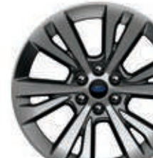
PLATINUM 22" 6-Spoke Painted Machined-Face Aluminum with Dark Tarnish-Painted Pockets Standard

5. Additional charge. Colors are representative only. See your dealer for actual paint/trim options. Models shown with available equipment.