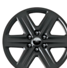
LIMITED 20" 6-Spoke Gloss Black-Painted Aluminum Optional n/a with 302A, or Stealth Edition (303A), FX4 Off-Road, Special Edition or Texas Edition Packages