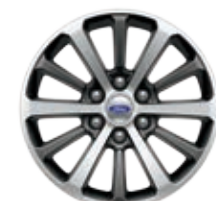
XLT 18" Machined-Face Aluminum with Magnetic-Painted Pockets Standard