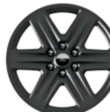
XLT 20" 6-Spoke Gloss Black-Painted Aluminum Optional Included with Black Accent Package n/a with FX4 Off-Road Packages