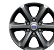
XLT 18" Magnetic-Painted Cast-Aluminum Included with FX4 Off-Road Packages