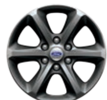
STX 18" Magnetic-Painted Aluminum Standard

Personal Safety System™ with dual-stage front airbags 4 Front-seat side airbags 4 Safety Canopy® side-curtain airbags 4 with rollover sensor AdvanceTrac® with RSC® (Roll Stability Control™) Individual Tire Pressure Monitoring System (excludes spare) MyKey® technology to help encourage responsible driving Perimeter alarm SecuriLock® Passive Anti-Theft System SOS Post-Crash Alert System™