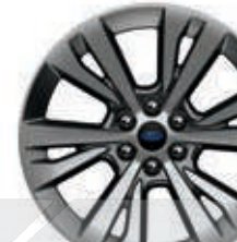
LIMITED 22" 6-Spoke Painted Machined-Face Aluminum with Dark Tarnish-Painted Pockets Included with 302A