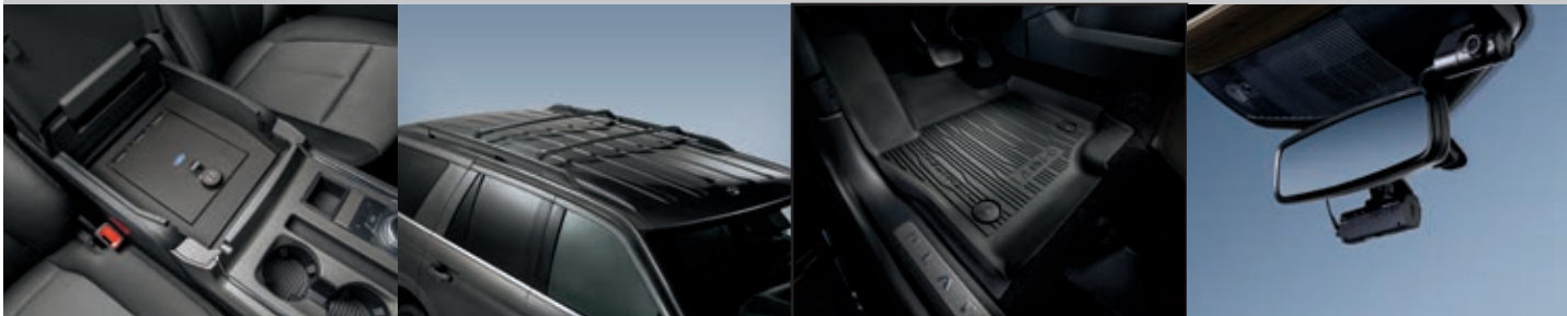
In-vehicle safe 2