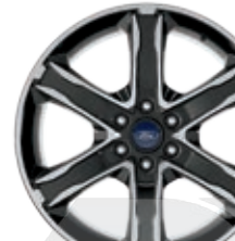
LIMITED 22" Premium Black-Painted Aluminum Included with Stealth Edition (303A), Special Edition and Texas Edition Packages