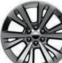
KING RANCH 22" 6-Spoke Painted Machined-Face Aluminum with Dark Tarnish-Painted Pockets and King Ranch "Running W" Center Cap Standard