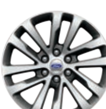
LIMITED 20" Premium Dark Tarnish-Painted Aluminum Standard