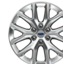
XLT 20" Polished Aluminum Optional n/a with Black Accent Package or FX4 Off-Road Packages